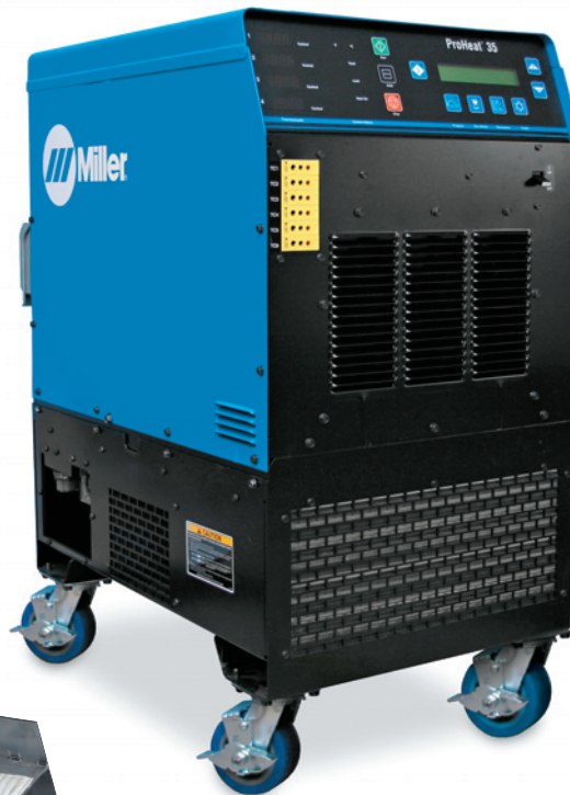
ProHeat 35 power source shown with heavy-duty induction cooler (951686) and optional running gear (195436).