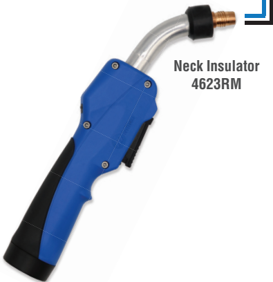
Neck Insulator 4623RM