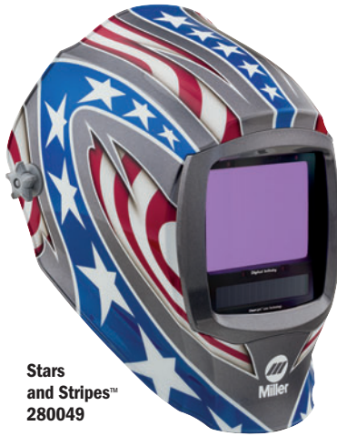
Stars and Stripes™ 280049