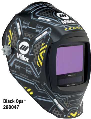
Black Ops™ 280047