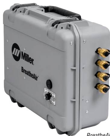
BreatheAir portable box