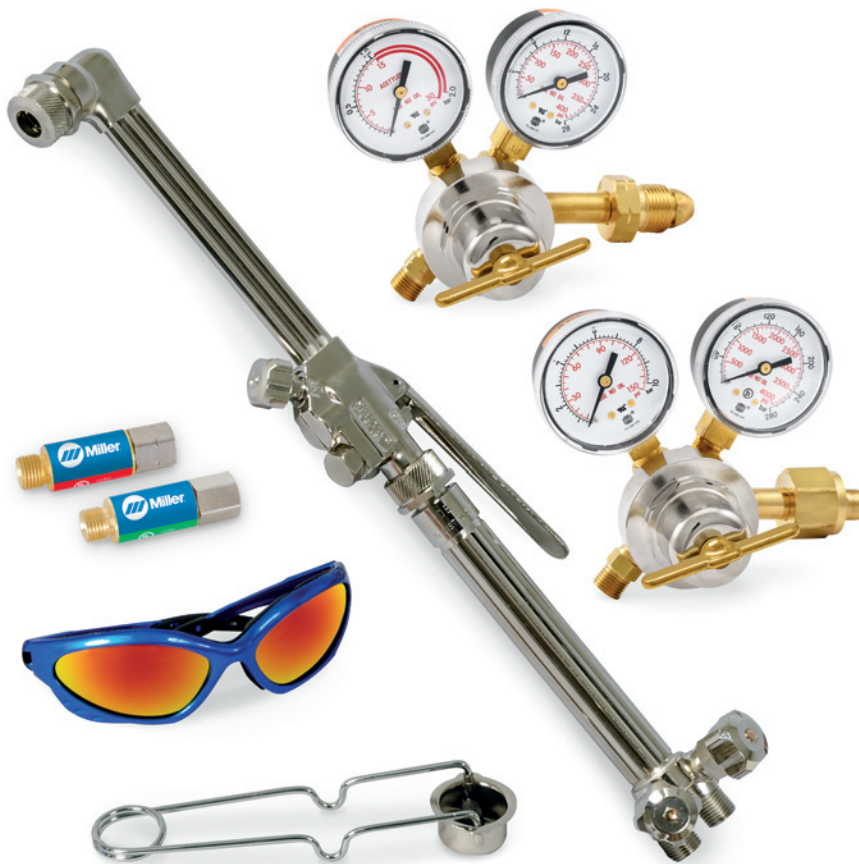
Toughcut Select CGA510 combo pack shown.

Performance and safety meet for an efficient way to upgrade your oxy-fuel system.