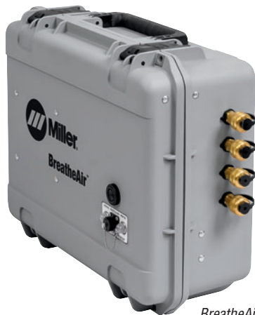
BreatheAir portable box