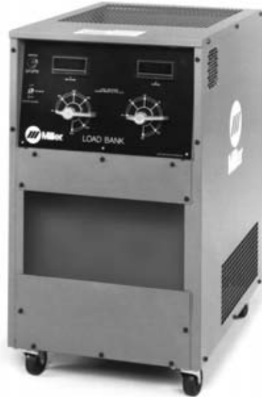
Welding Power Load Bank

The welding power load bank is designed to load test the output of transformer-type, engine- or motor-driven generator welding power sources. This portable unit can be used to test AC or DC welder outputs, and to demonstrate welding equipment to prospective customers.