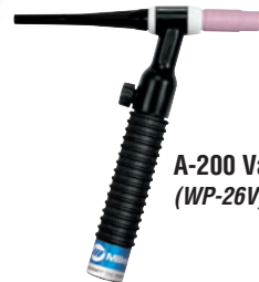
A-200 Valve (WP-26V)