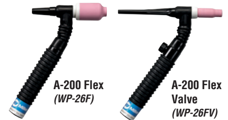
A-200 Flex (WP-26F)