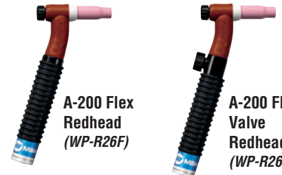
A-200 Flex Redhead (WP-R26F)