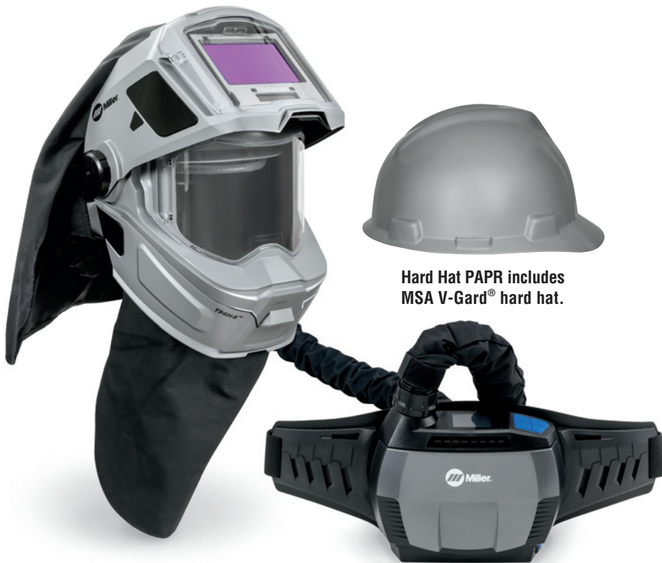
Hard Hat PAPR includes MSA V-Gard® hard hat.