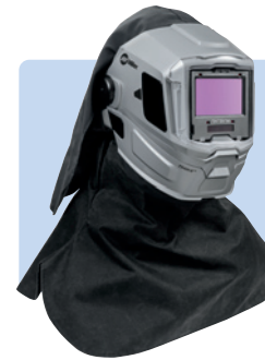
Optional heavy-duty head seal provides additional protection with an APF of 1,000.