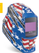
Stars and Stripes™ III