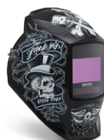
Lucky's Speed Shop™