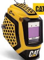
Cat® Edition 1