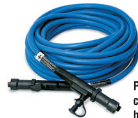
ProHeat liquid-cooled induction heating cable.

Improved working environment is created during welding. Welders are not exposed to open flame, explosive gases and hot elements associated with fuel gas heating and resistance heating.