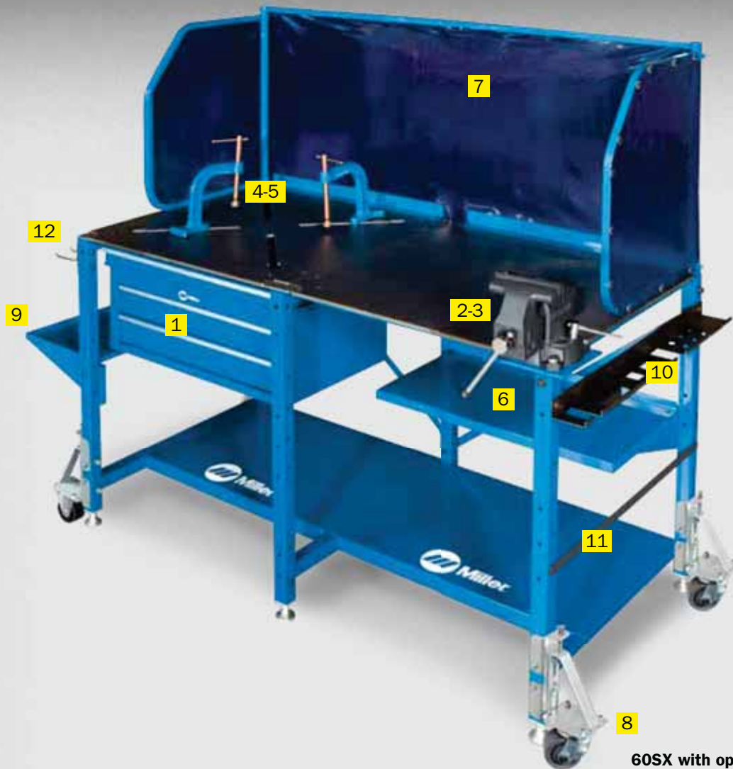
60SX with optional accessories