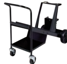
Running Gear #770 187 Heavy-duty construction. Convenient handle on front with cable holders. Maximum weight 100 lb (45 kg).