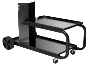
Small Running Gear #300 425 Durable construction. Maximum weight 75 lb (34 kg).