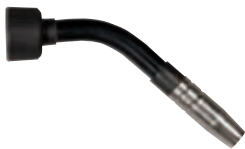
45-Degree Barrel #300 591