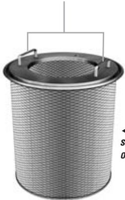
◀ Filter: 490 square feet of media

Filter Handles allow easy replacement of dirty filter cartridge with less mess, minimizing downtime.