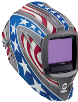
Stars and Stripes™ 288420