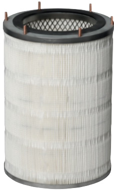
FilTek® XL Filter 301267 Manually cleanable flame-resistant (FR rated) replacement filter for FILTAIR 130.