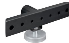
Slotted Magnetic Nozzle 300895 12 in. wide (305 mm) nozzle with magnetic base.