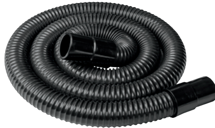
Extraction Hose 300896 17 ft. (5.2 m) length 300897 34 ft. (10.4 m) length